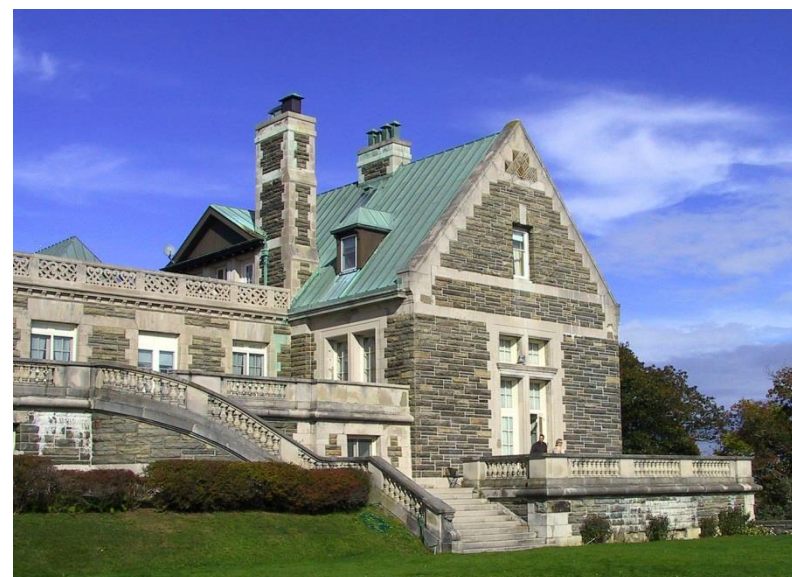
Arden Villa, Orange County, New York