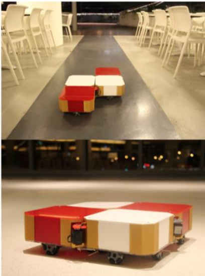
hTetro – A Tetris-inspired Floor Cleaning Robot

Photos of robots developed by Singapore University of Technology and Design (SUTD)