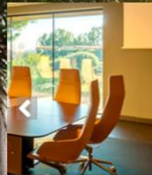
CONVENTION CENTRE VIDEOS