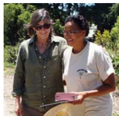
Soil for Life staff member (right) with Rooftops Canada volunteer