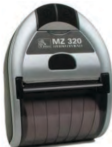
Optional Wireless Printer